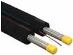
Double solar pipes